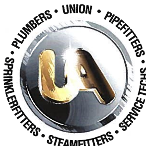
Plumbers | Steamfitters Service Techs | Sprinkler Fitters