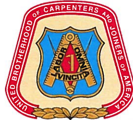
Carpenters | Millwrights Piledrivers